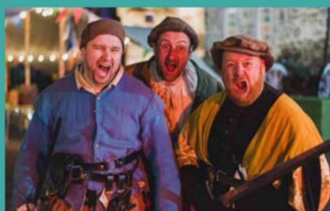
Inspiring events - something for everyone