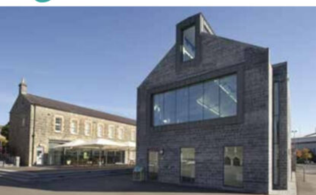
Key to exploring Fermanagh's unique stories