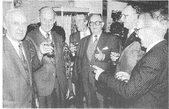
Friends at the opening of the exhibition.