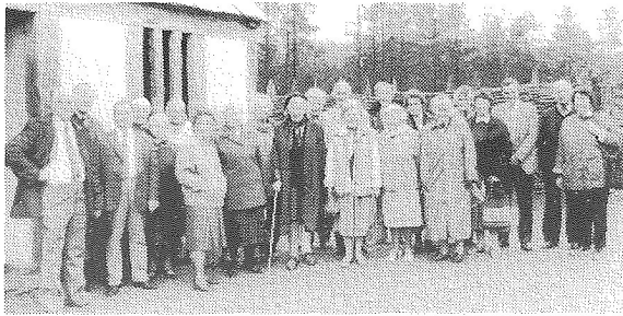
The Friends at the Ulster American Folk Park

The Friends of Fermanagh County Museum went on a bus trip to the Ulster American Folk Park on 18 May 1991. The annual bus trip has become a popular outing with our friends. It is always a relaxed day accompanied by regular stops for refreshments. This year our lunch stop was at the Mellon Inn near the Folk Park where we dined well in pleasant surroundings. The Friends also visited the Ulster History Park at Gortin to see modern reconstructions of archaeological and historical sites. These include an impressive Middle Stone Age dwelling roofed with deer hide, an Iron Age crannog, an early Christian church and round tower, a Norman Motte and Bailey and several Stone Age settlements.