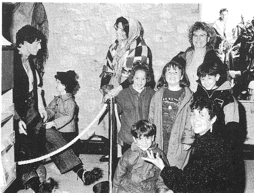
Some of our younger visitors enjoying the exhibition