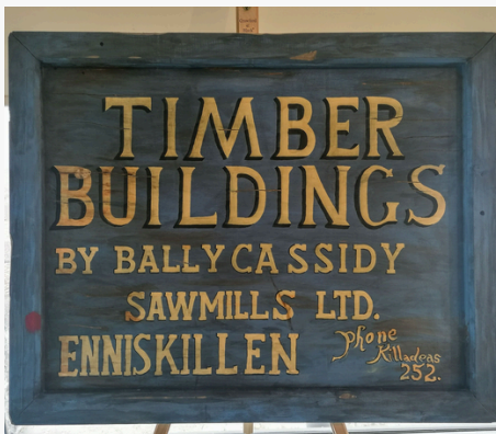
"A History of Sawmilling in Fermanagh"