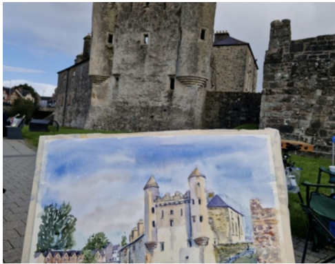
Hosting the Enniskillen Plein Air Weekend

The Castle also plays hosts to other people's events, including the highly successful "Big Community Paddle, Picnic & Volunteer Village", organised by Headhunters Railway Museum, and the first-ever Plein Air Weekend, organised by the Ulster Society of Women Artists.