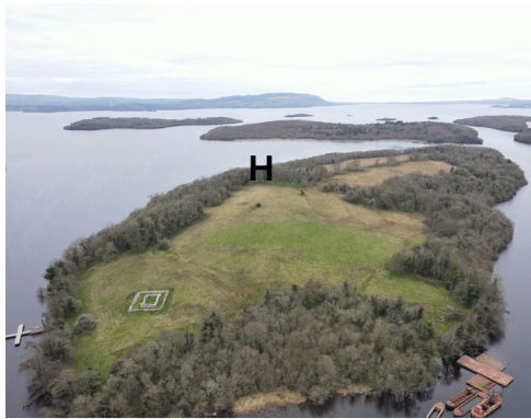
White Island & Davy's Island: Discovering New Archaeological Findings Community Day

The Castle also plays hosts to other people's events, including the highly successful "Big Community Paddle, Picnic & Volunteer Village", organised by Headhunters Railway Museum, and the first-ever Plein Air Weekend, organised by the Ulster Society of Women Artists.