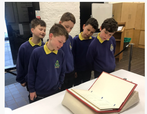
Pupils from Holy Trinity Primary School, study the signed copy of the Belfast (Good Friday) Agreement

"Here the past is before us, warm with its old sacred life and indomitable energy."