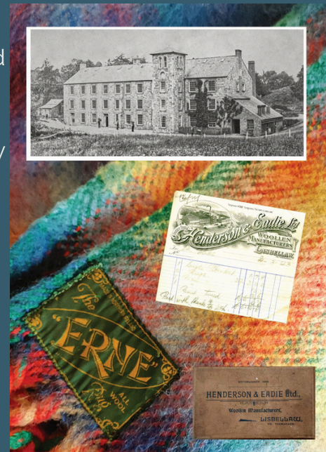
"The Lisbellaw Woollen Mill" exhibition opening