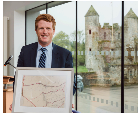
The U.S. Special Envoy to Northern Ireland for Economic Affairs, Joe Kennedy III

83,679 people visited Enniskillen Castle; 8 exhibitions were opened; 6 talks were held; 6 trails were offered; 12 additional events organised; 9 public events hosted; 246 objects, documents & photographs were accessioned into our collections; 104 school visits & 75 general tours (school year).