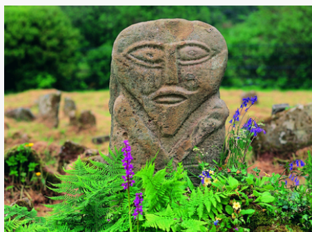
Boa Island Dreenan Figure represented in the Lough Erne Pilgrim Way exhibition |

Devenish: Its History, Antiquities and Traditions, J.E McKenna, 1897