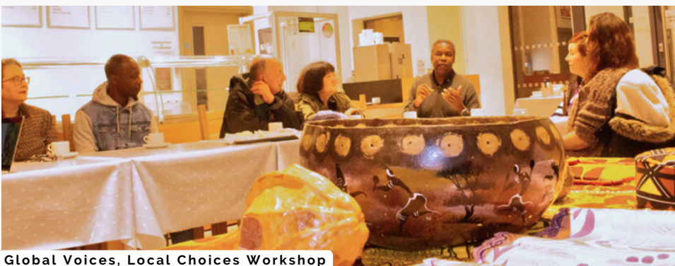
Global Voices, Local Choices Workshop

"I like how this project has brought in voices that would otherwise be marginalised. This has changed my perception of museums."