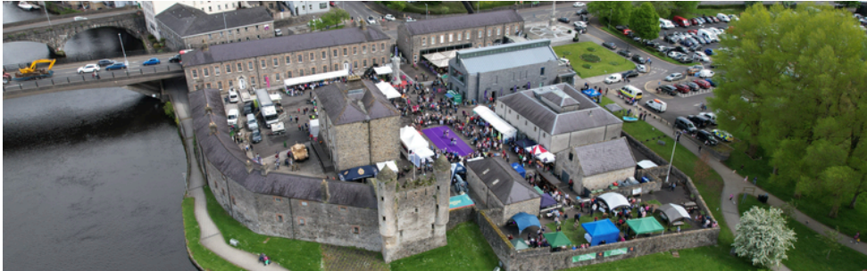
Hosting the Big Community Paddle, Picnic & Volunteer Village