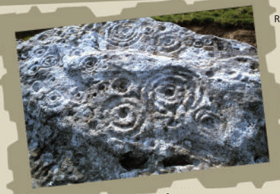
Reyfard Stone, County Fermanagh

2500BC The earliest copper objects and Beaker pottery date from this time.