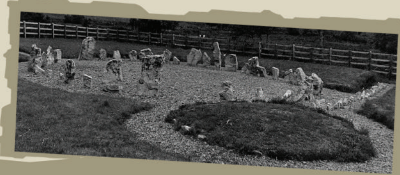
Drumskinny Stone Circle, Irvinestown

1. Try matching each Stone Age sickness with its crazy Stone Age cure!