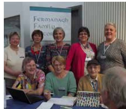
Fermanagh Genealogy volunteers