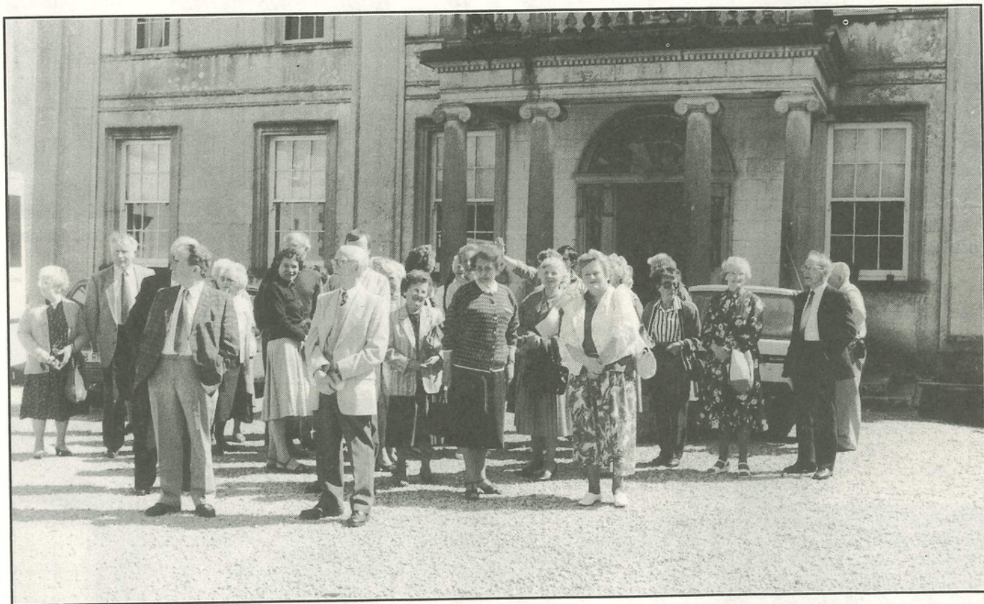
Ready and waiting for the guided tour of Strokestown Park House.