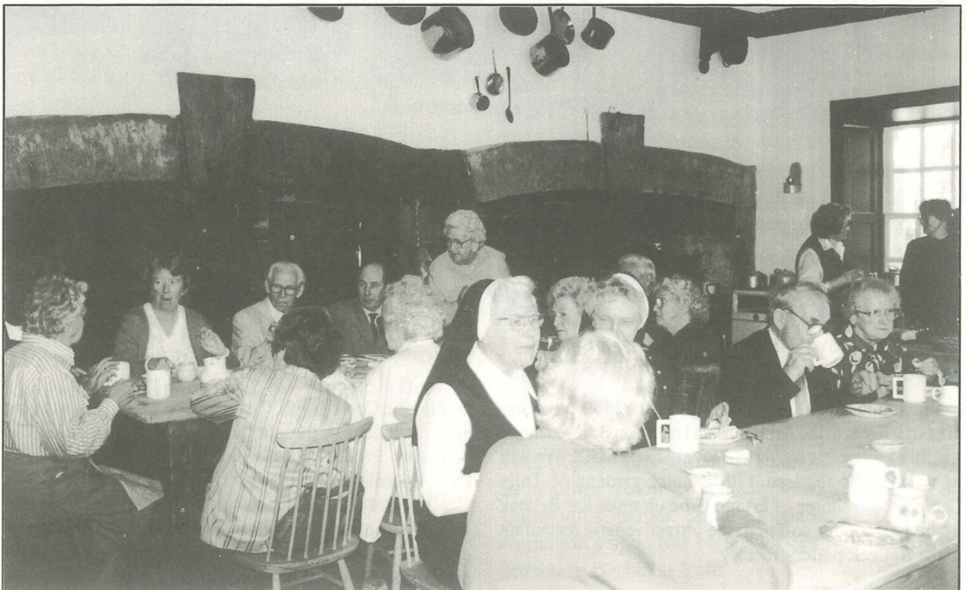
"Friends" enjoy morning coffee in the kitchen of Strokestown Park House